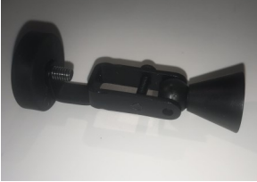
Magnet 0301 2380