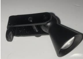
Surface 0301 2370