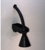
Press in fibre micro termination