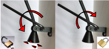
Position adjustment using allen key