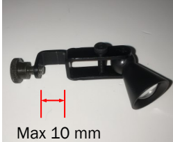
Max 10 mm Clamp Single 0301 2375