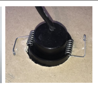
Make a Ø40 mm hole