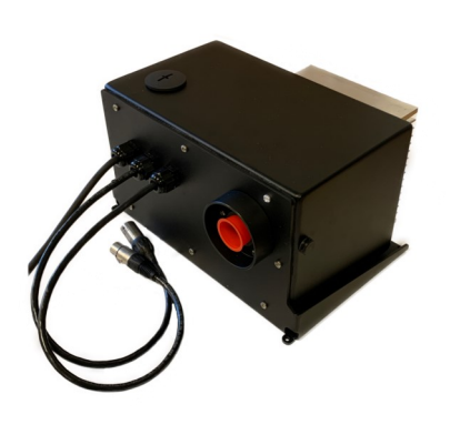
WARNING! Remove cap before turning on.